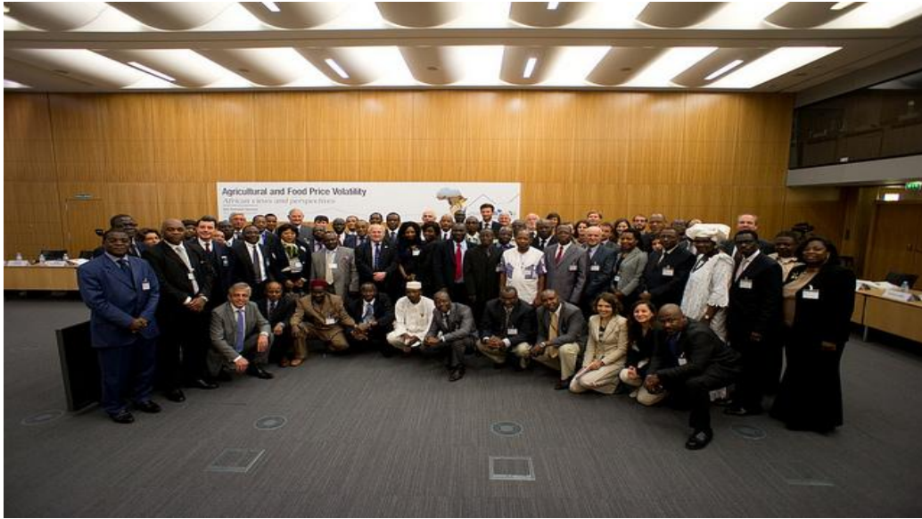
Participants at OECD/SWAC Conference on “The Impact of Settlement and Market Trends on Food Security” (Paris, 27-28 October 2011)