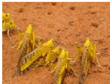
The food crisis of 2004/05, provoked by drought and attacks of desert locusts, posed special challenges for the young CSA.

forced to sell their dying animals at desperation prices to buy high-priced grain. Consumers throughout the country, many of whom spend a high proportion of their earnings on basic staples, saw their real incomes plummet as prices rose. All of this took place in an atmosphere of great