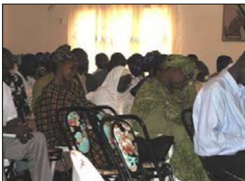
Participants in the PROMISAM-CSA Training of Communal-level food security trainers in Sikasso